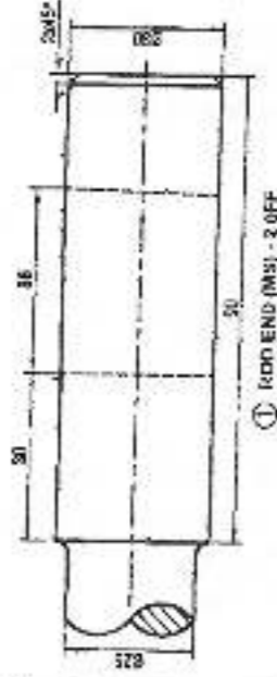
DETAILS OF SLEEVE AND CUTTER JOINT